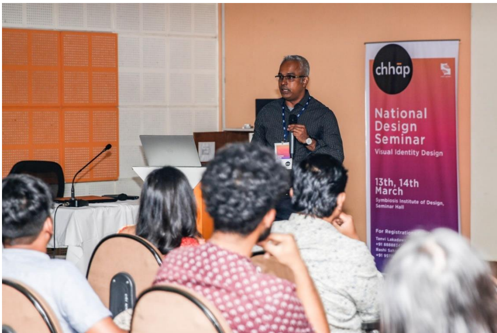
More practical tips for students to adapt in the ever evolving world of digital