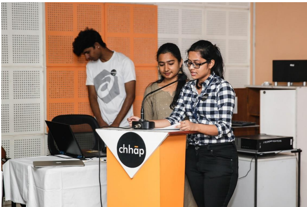
Students competing the event of Chaap.